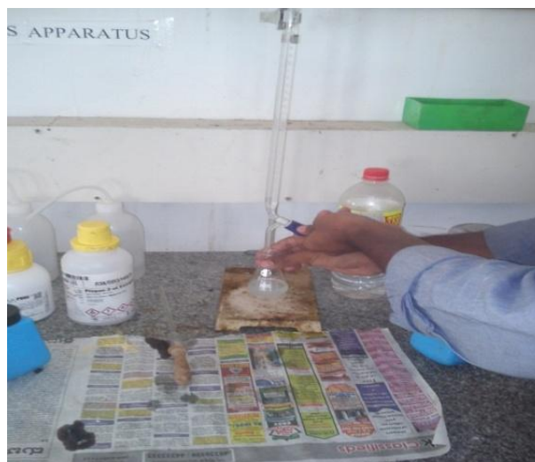
FIG 1: FFA TESTING EQUIPMENT