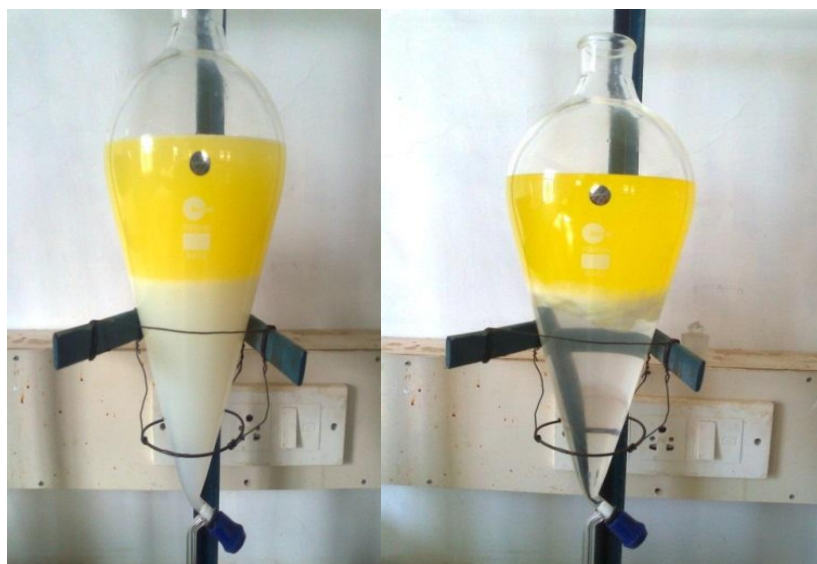
FIG 6: Water Wash (1st Water wash, 2nd Water wash)

The biodiesel obtained is washed 3 times with water to remove the catalyst. If clear wash water is got back it indicates that the catalyst is not present in the biodiesel. This is later heated to 100 degree centigrade to get dry biodiesel which is free from moisture .Thus neat bio diesel is obtained.