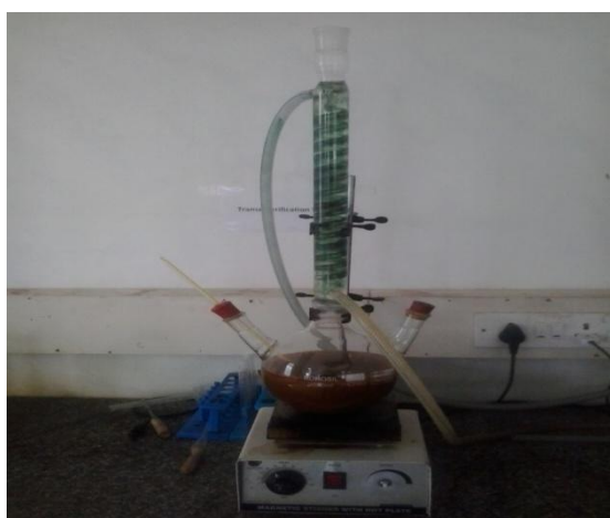
Fig 2: Trans-esterification setup