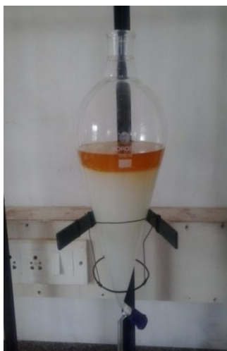
FIG 4: Water Wash

The biodiesel obtained is washed 3 times with water to remove the catalyst. If clear wash water is got back it indicates that the catalyst is not present in the biodiesel. This is later heated to 100 degree centigrade to get dry biodiesel which is free from moisture. Thus neat bio diesel is obtained.