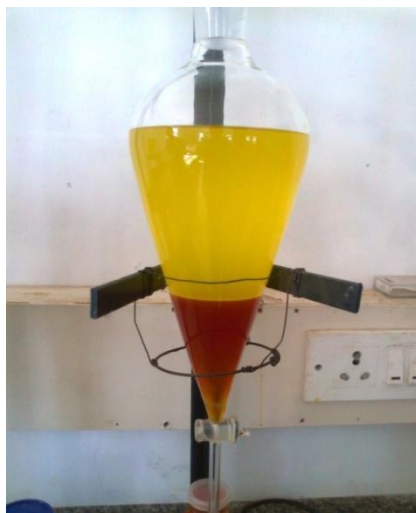
FIG 5: Formation of Glycerine Layer