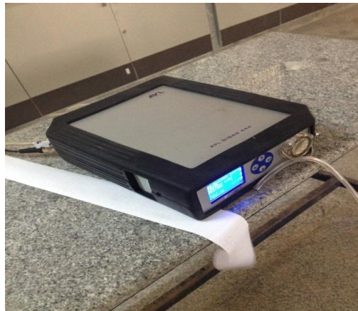
FIG 10: AVL DIGAS 444 Exhaust analyser