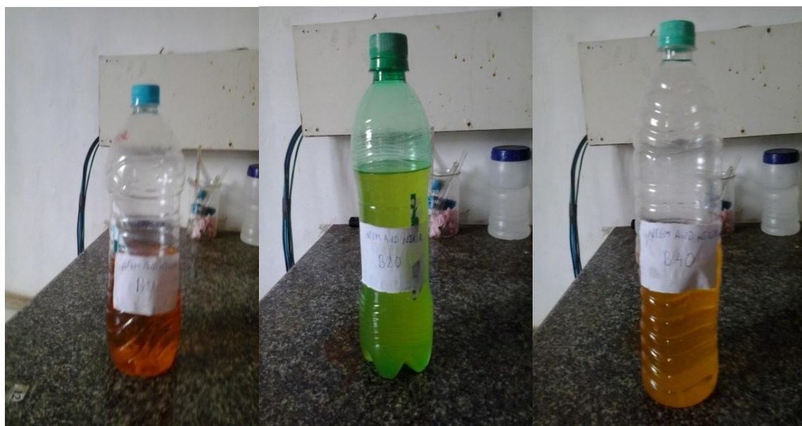
FIG 7: Blend B00